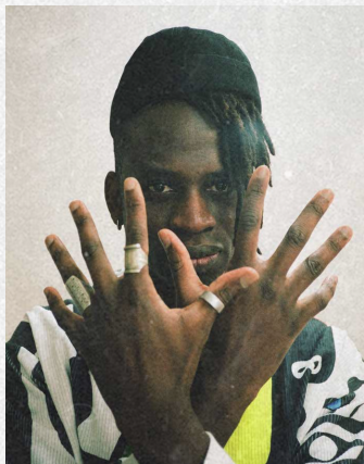
Listen to: 'Figurine'